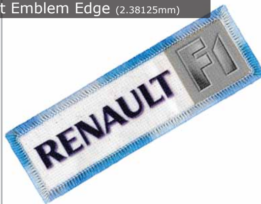
Small Patches and Labels