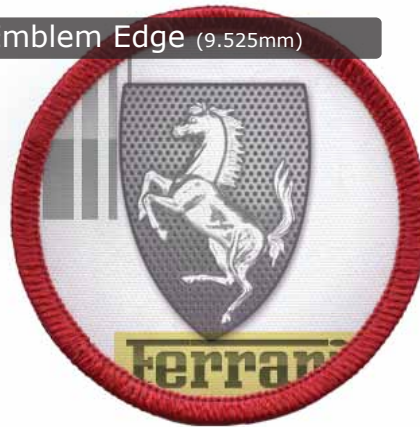
Company Insignias And Emblems