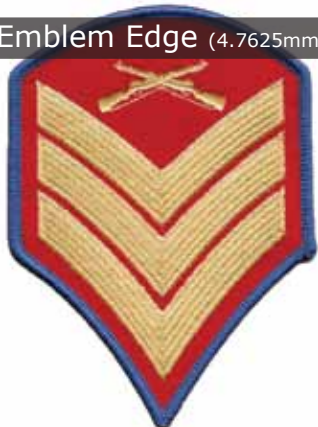
Military Badges And Insignias