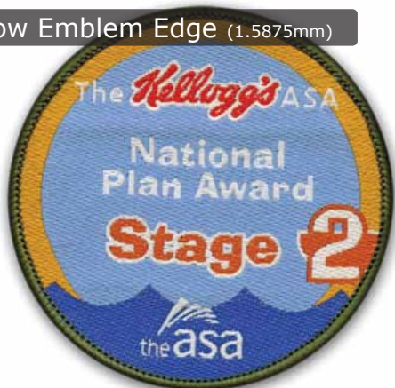
Narrow Patches and Emblems